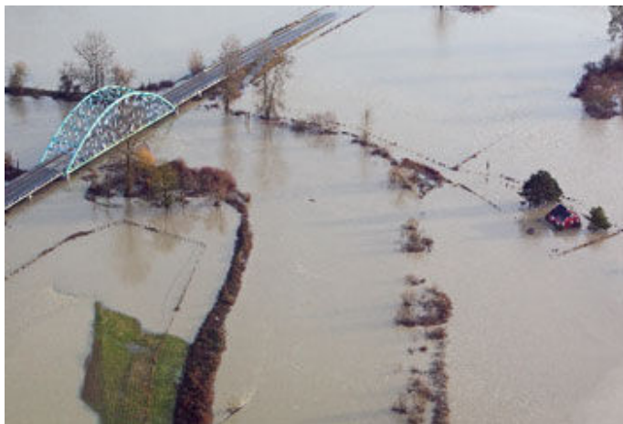
Rivers overwhelmed with rapid snowmelt accelerated by warmer than seasonable temperatures breach their banks flooding neighboring fields and houses.

This winter, residents of western Washington state were hit with a big one-two punch. An arctic blast in December brought record snowfall and unseasonably cold temperatures, then a "pineapple express" of warm, moist air coming off the Pacific Ocean followed just a few weeks later. As several days of heavy rain falling on top of the just-melting snow led to extreme flooding across the region, LightHawk was able to respond quickly to position a team above the flood plain to capture the local story on a heated global issue.